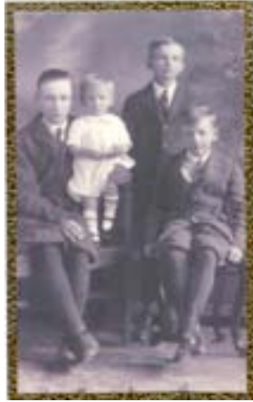
The Boys in 1924