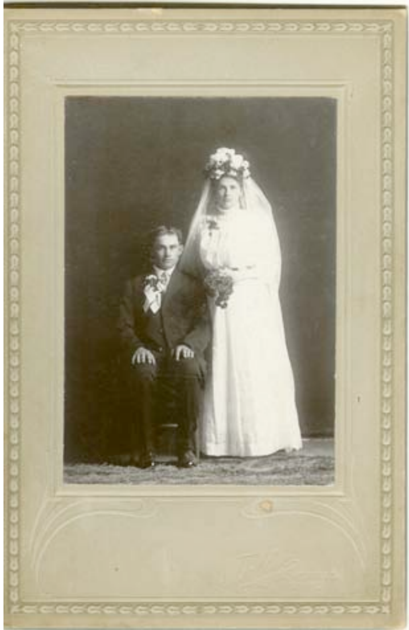
Wedding 24 May 1909

b. 12 Jul 1888, Waverly, Minnesota d. 15 Apr 1974 Artesia, New Mexico