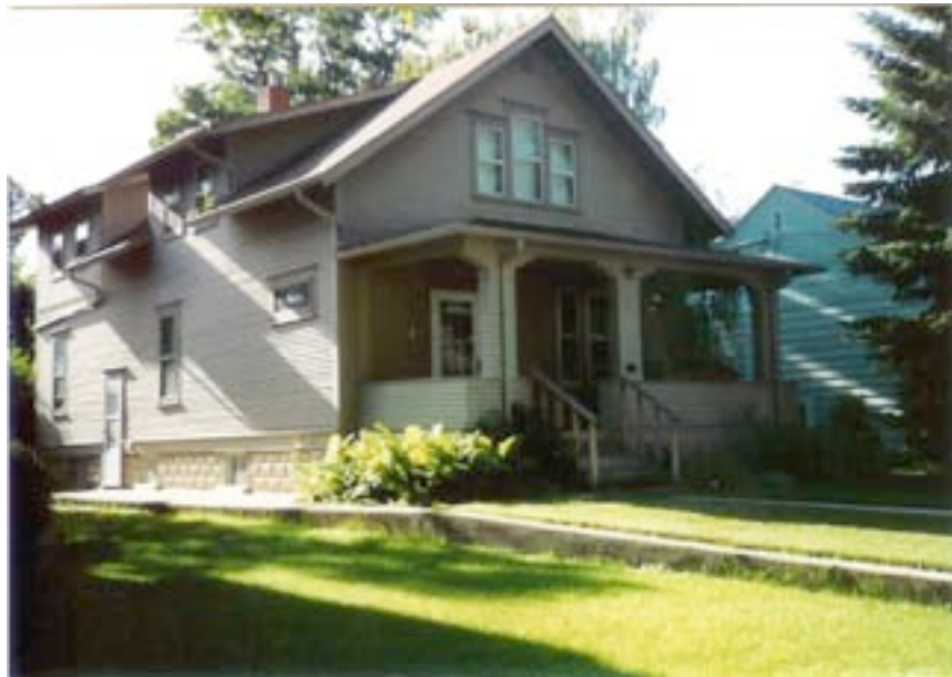
209 9 th Street SE, Minot